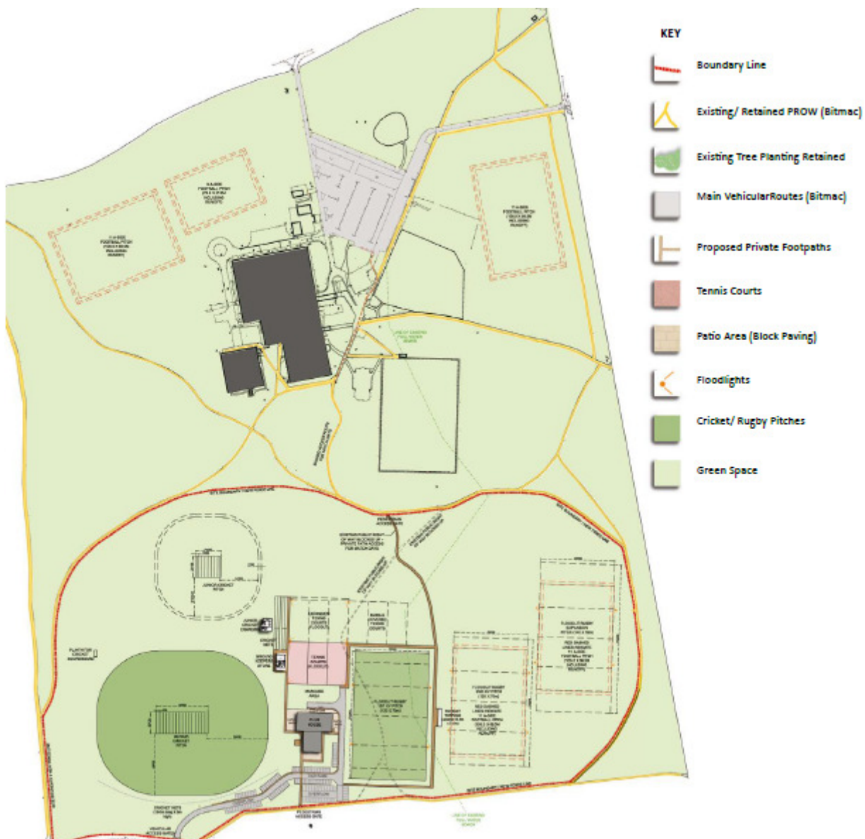
Figure 2: Site Layout

The application proposes the development of a new high-quality playing pitches and a to deliver a new state of the art, purpose-built club house and associated pitches and facilities. The new facility will include the relocation of the existing facilities at Westoe Sports Ground. The application will provide the same level of sporting facilities as the existing ground whilst allowing additional flexibility and a wider range of pitches. The proposed site layout is shown in Figure 2 below: